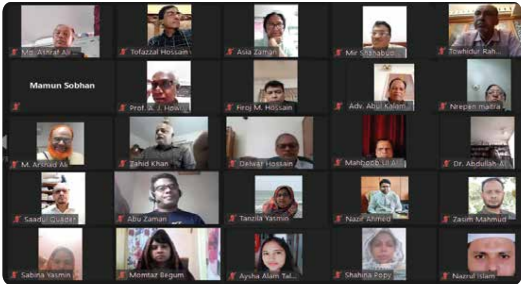
The National Mourning Day 2021 Observed in Prime University

Prime University observed the national mourning day and the 46th death anniversary of Bangabandhu Sheikh Mujibur Rahman, the greatest man in Bengali history with due respect and solemnity. Bangabandhu Sheikh Mujib was assassinated along with all but two of his family members on August 15, 1975 at his Dhanmandi residence in Dhaka by a group of perverted of army personnel. This day of grief is being celebrated every year as the National Day of mourning in the country and abroad in a solemn atmosphere. Like every year, Prime University observed this day with solemnity to pay homage to the departed souls of the martyrs on 15th August, 1975. But due to the Covid-19 pandemic Prime University organized a virtual discussion program followed by a Doa Mahfil.