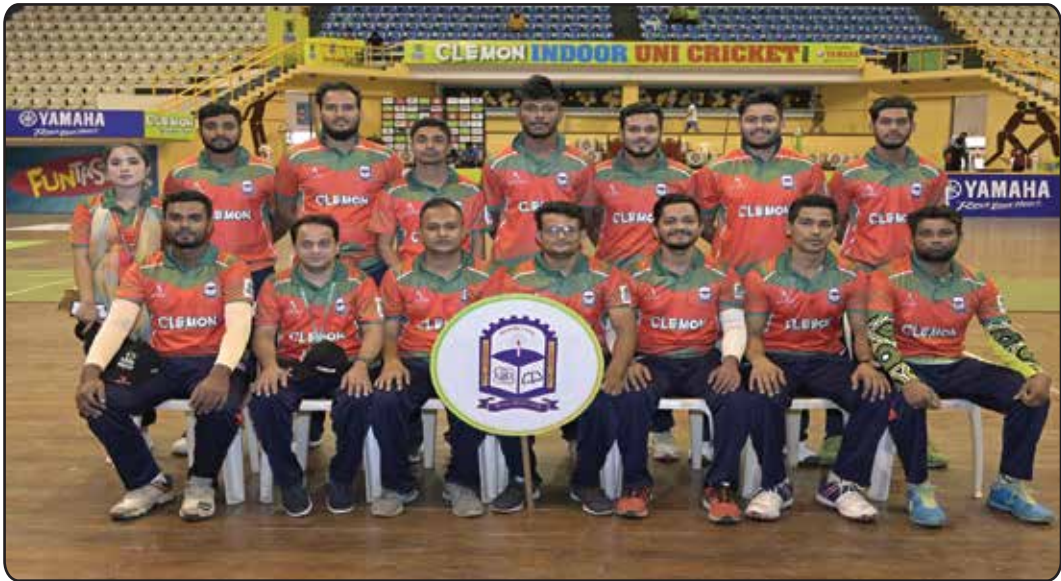
Prime University Cricket Team

The Prime University Cricket Team participated in the 6th Edition of Clemon Indoor Uni Cricket-2022.