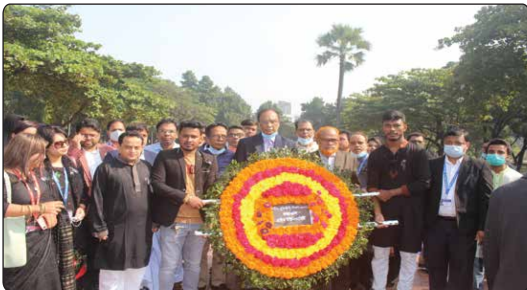
The Vice Chancellor along with the Dean of different faculties, Registrar, Heads and faculty members of different departments, executives and students on the way to pay tribute to the Martyred Intellectuals

Prime University observes Martyred Intellectuals Day on 14th December 2021 with due solemnity to remember the intellectuals slaughtered during the Liberation War of Bangladesh. Prime University arranged a rally from the University premises to the "Mirpur Shahid Buddhijibi" Mausoleum to observe the day in a befitting manner. On this occasion, the national flag was hoisted at half-mast along with the black flag in front of the University campus.