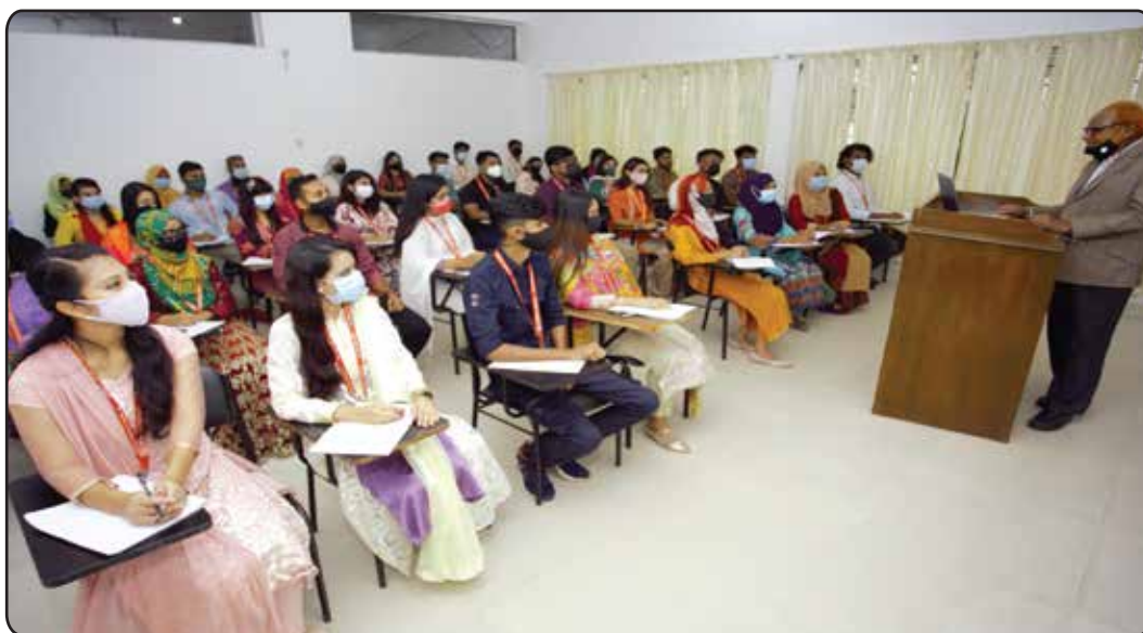
Students at the class room

Here students get all kinds of facilities, being enrolled in BBA and MBA programs. There are worthy and experienced full-time teachers in the university. Besides, teachers from IBA, Dhaka University, Jahangirnagar University, Rajshahi University and Jagannath University are involved as part-time teachers in the university. In every semester workshops, seminars, presentations, etc. are arranged to increase students' level of confidence and make them worthy for the competitive world.