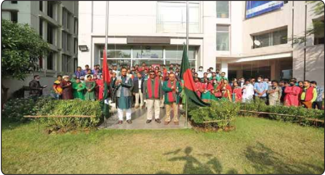
The national and the University flags are being hosted by the Chairman, BoT and the Vice Chancellor respectively on the Victory Day, 2021

The Prime University celebrated the Glorious Victory Day on 16 December, 2021 with due solemnity and great enthusiasm. The University arranged different programs to observe the ‘Golden Jubilee’ of the victory of the nation.