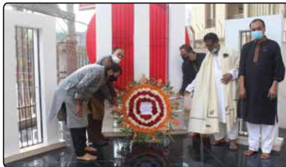
A view paying with the floral wreath by the members of Board of Trustees and the Vice Chancellor