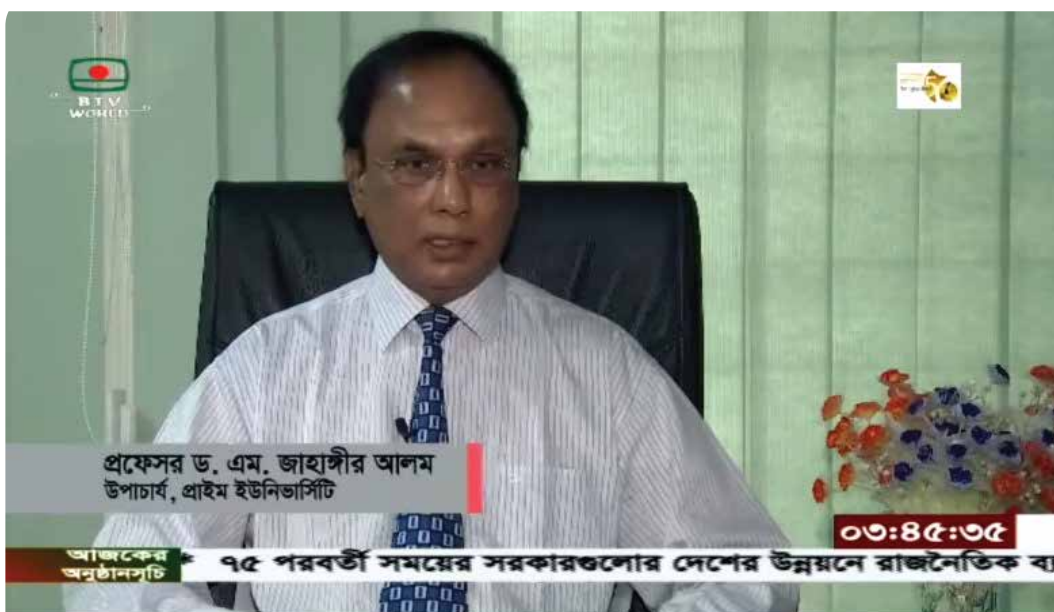
Vice Chancellor in 'Shuddhachar' program telecast by BTV