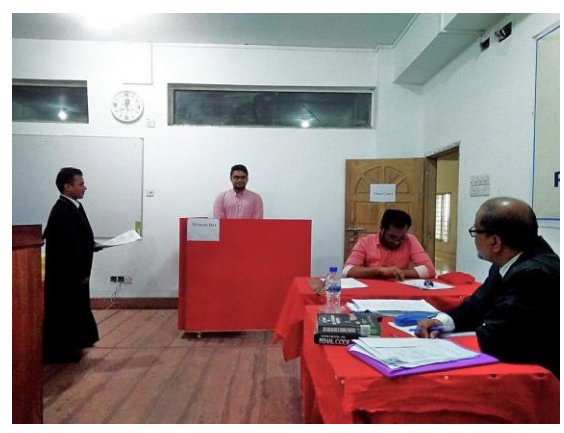
A view of the Mock Trail by the students of 40th batch, Department of Law

With a view to building up the credible legal skills of the students, the Department organized a mock trial (a simulation of real trial) for the students of