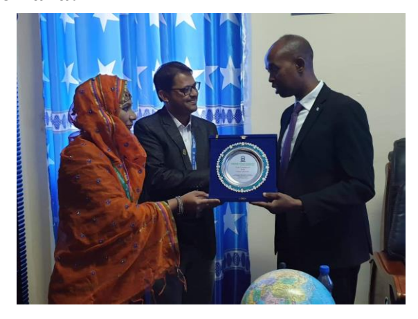
PU team handing over a crest to Hon'ble Minister of Labor and Social Affairs of Federal Government of Somalia, Sadiq Warfa