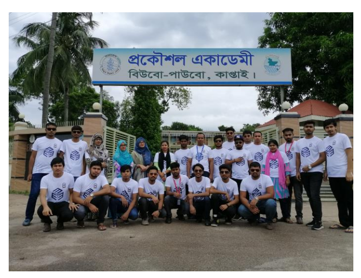
Students and the Faculty Members during the power plant visit

During the inspection, the students were briefed regarding the first feasibility study for setting up a hydroelectric power plant located at Kaptai in Bangladesh. It is the only hydroelectric power plant which was started in 1908 in the country. Kaptai Dam was constructed in Kaptai upazila under the district of Rangamati with a dam on the river Karnafuli. The center started its journey in 1982 with two units of 48 MW each. Later, three more 50 MW units were set up. Unit number three was added in 1982, and units number 4 and 5 were established in 1986. The first three of these are set in U.S. technology. The next two were set up by Tokyo Electric Power Services Company (TEPSCO) of Japan. At the time of installation of these two, ancillary facilities were left for setting up of two more units. It was the Japanese company that explored the possibility of generating more electricity there in 1997. At present there are five units in operation with a total power generation capacity of 230 MW. The students were fortunate to witness the process through which a hydroelectric power plant works.