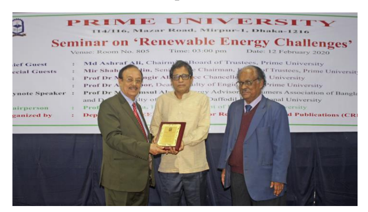
The speaker of the seminar receiving crest from the Chairman, BoT