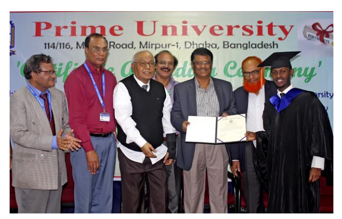
A foreign student receiving certificate from the Chairman, BoT