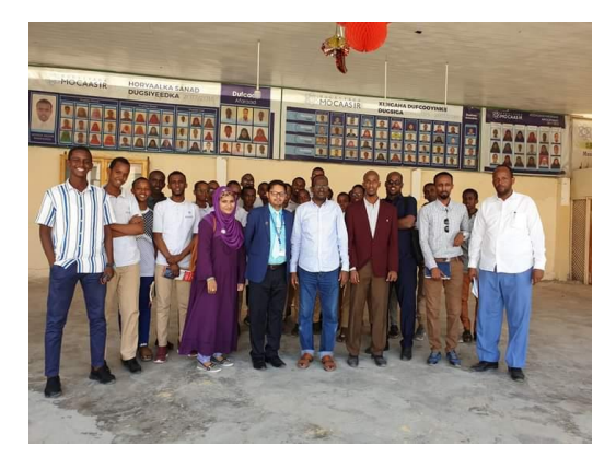
Visiting Moasser Primary and Secondary School