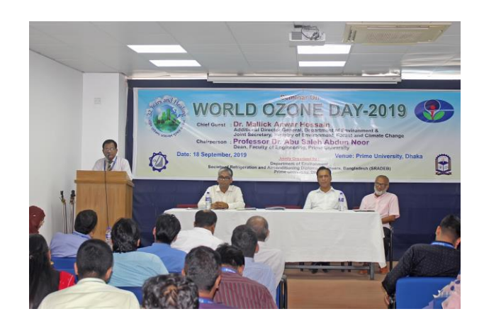
The Chairman of the seminar delivering speech