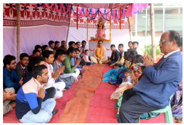
Devotees performing the Saraswati Puja-2020

Saraswati Puja was celebrated with great enthusiasm at Prime University premises on 15 Magh, 1426 Bangla and 30 January (Thursday) 2020. Devotees, teachers and students entered the pandal seeking the blessing of the goddess of learning. Around fifty devotees celebrated the Saraswati Puja by setting up colorful mandap and placing the idol of the goddess with different types of sweetmeats, fruits and other items and articles of handicrafts. The rituals started at 8:30 am with the establishment of Pratima. The celebration also included Devi Aradhona, Pushpanjoli, distribution of prashad and ceremonial immersion of Devi idol with priests chanting mantras and devotees placing palash flowers at the Deity's feet with the sounds of cymbal and conch shell.