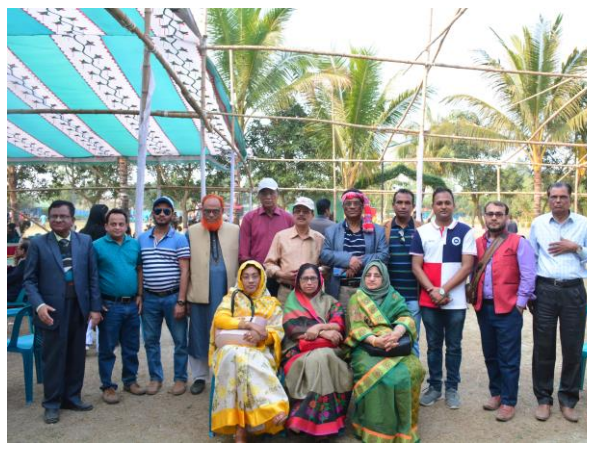
A memorable view of the picnic