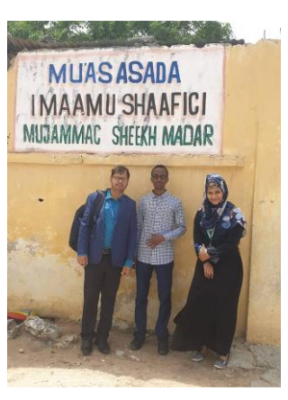
Muasasada Imaamu Shaafici Mujammac Sheekh Madar