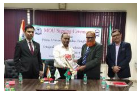
MoU with Centurion University