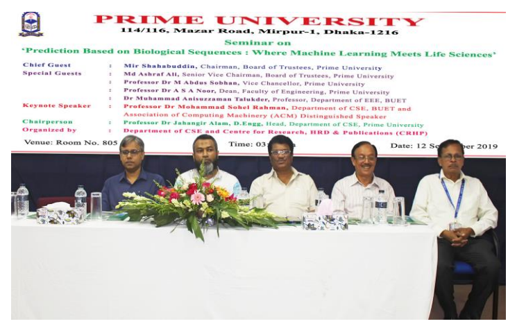
The Chairperson, guests and the speaker sitting at the dais during the seminar

Department of Computer Science & Engineering