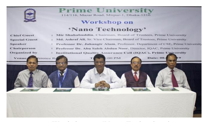
Workshop on 'Nano Technology'