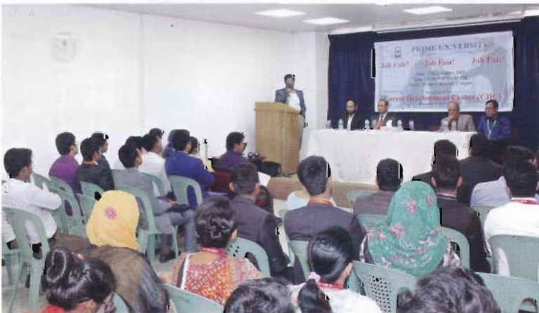
Chairman, BoT delivering speech during the job fair discussion session