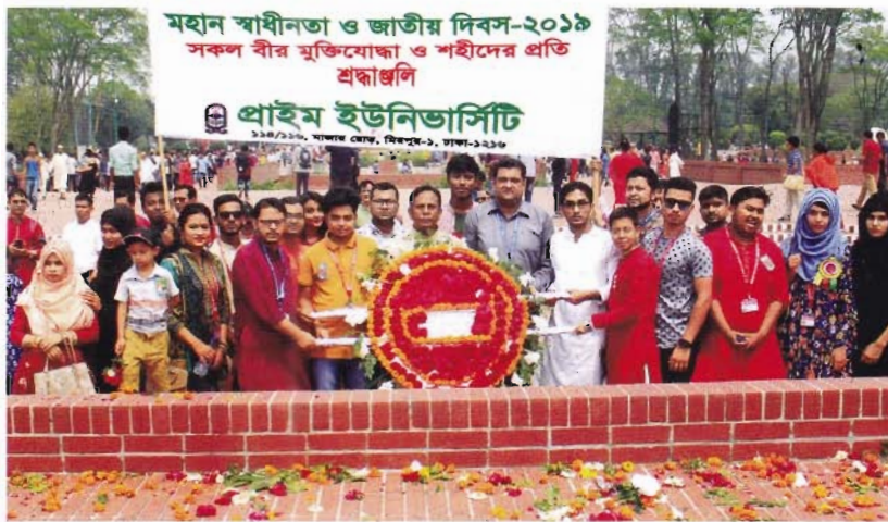
Proctor of the University along with others placing floral wreath at the national mausoleum