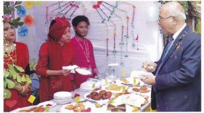
Vice Chancellor visiting a stall at the Pitha Utshab