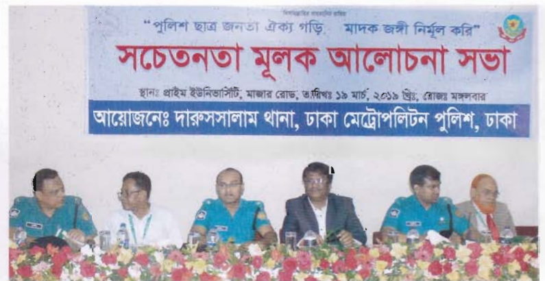
A view of the program