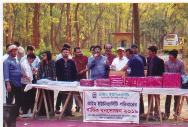
On the eve of prize distribution at the picnic spot

Apart from roaming around the natural forests in the midst of trees, birds, flowers and monkeys, riding on boats and horses, enjoying cultural activities and exciting "Raffle Draw" also made the picnic a memorable one.