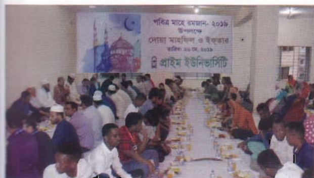
A view of the Iftar Mahfil