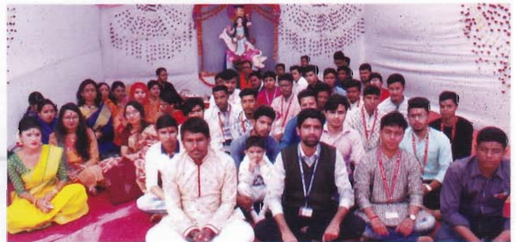
Students at the puja mandap

On 10 February (Sunday) 2019, Prime University celebrated the Saraswati Puja with traditional gaiety, religious fervor and spirit for the pursuit of art and knowledge. The puja started at 8.00 am and Pushpanjali was held at 9:30 am in that morning. The liturgy was graced with the presence of Senior Vice Chairman of Board of Trustees, Vice Chancellor, Deans of different faculties, Registrar and Heads of different departments. On that day, university campus wore a festive look with colorfully decorated puja pavilions. The organizing committee ended the event by serving prasada among the attendees.