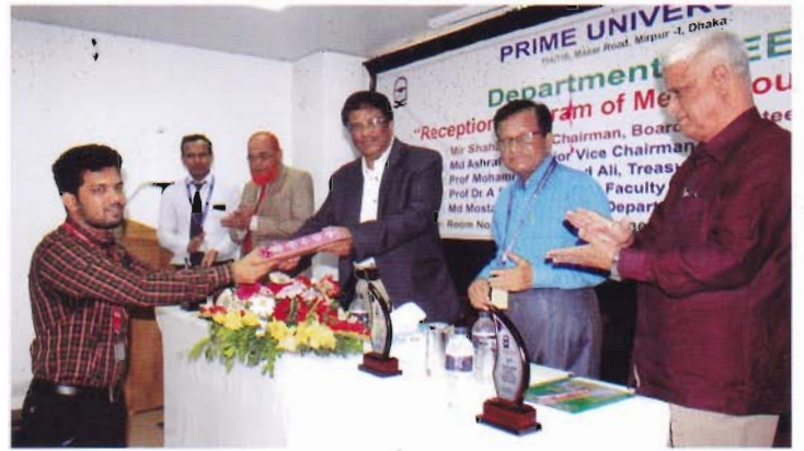
A meritorious student receiving prize from the Chairman, BoT