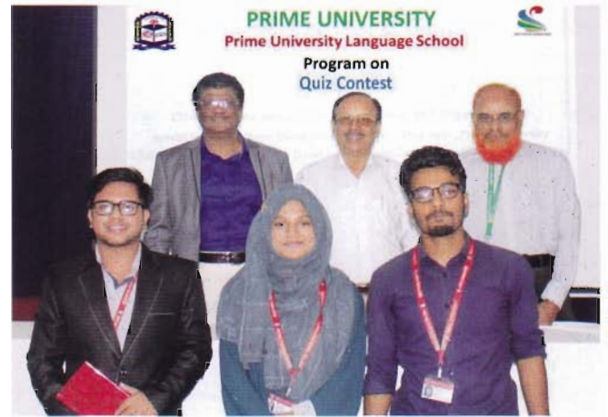
The winners of the quiz contest with Chairman and Senior Vice Chairman, BoT and Treasurer, PU