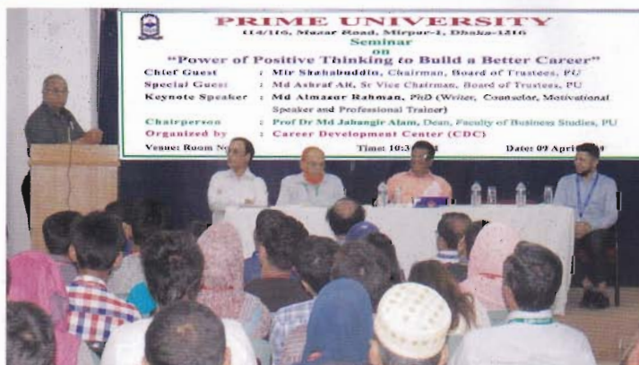
The keynote speaker of the seminar delivering motivational speech