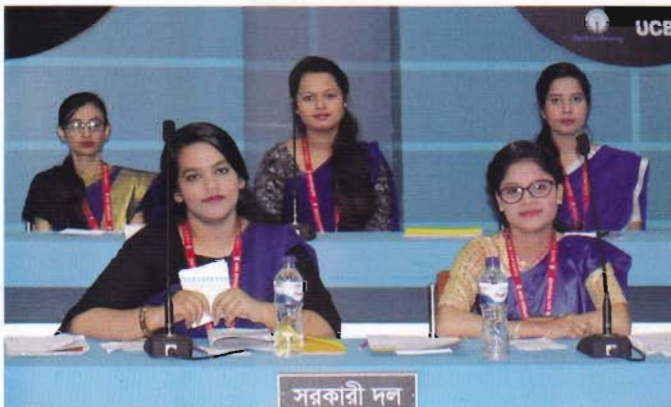
The participants from Prime University at the ATN debate