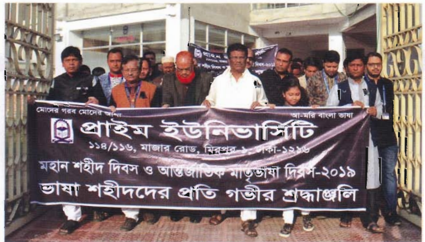
Chairman, BoT, Treasurer, Dean, Faculty Members, Executives and Students on their way to pay homage to the martyrs on 21.02.2019