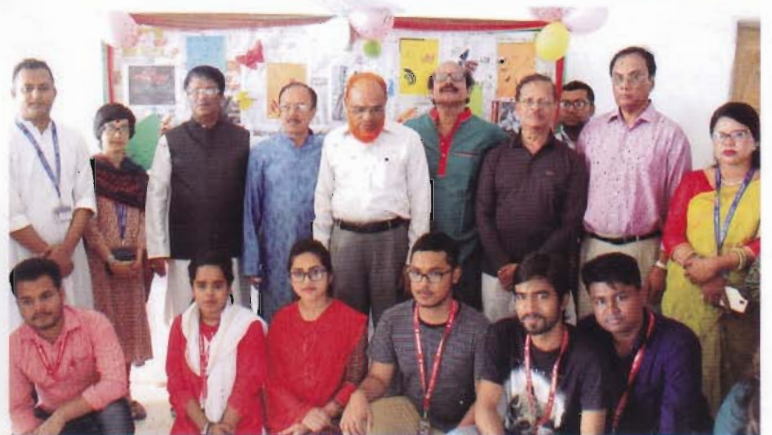
Chairman and Sr Vice Chairman, BoT along with others in front of the wall magazine