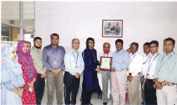
The keynote speaker receiving crest from the Chairman, BoT