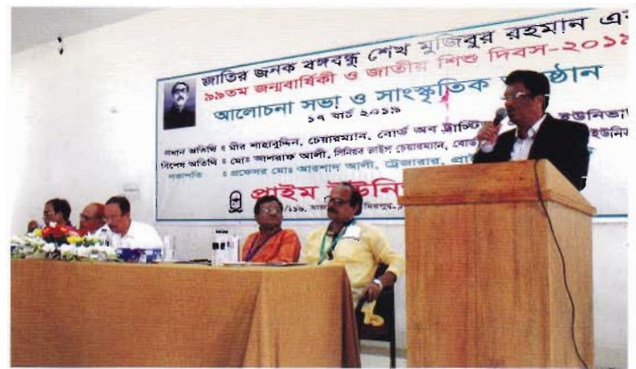
Chairman, BoT delivering speech during discussion session of the program on 17.03.2019

To celebrate the Birthday of the Father of the Nation a huge cake was cut by the chief guest of the program and distributed among the guests and the presence. The program ended with a vibrant cultural program performed by the students of the University.