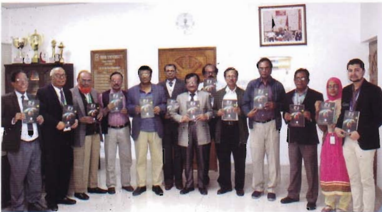
A view during the unveiling of the Annual Magazine 'The Ray'

The Centre for Research, HRD and Publications of the University published the third issue of the Annual Magazine of Prime University 'The Ray'. The foremost contributors of the Magazine are the students, faculty members, executives and staffs. The magazine was unveiled on 04.02.2019 in the presence of the Chairman, Senior Vice Chairman and Vice Chairman of the Board of Trustees. Vice Chancellor, Treasurer, Deans of different faculties, Registrar, Head of the Department of CSE, Editor, Co-Editors and Member Secretary of the Editorial Board of 'The Ray' were also present during the event.