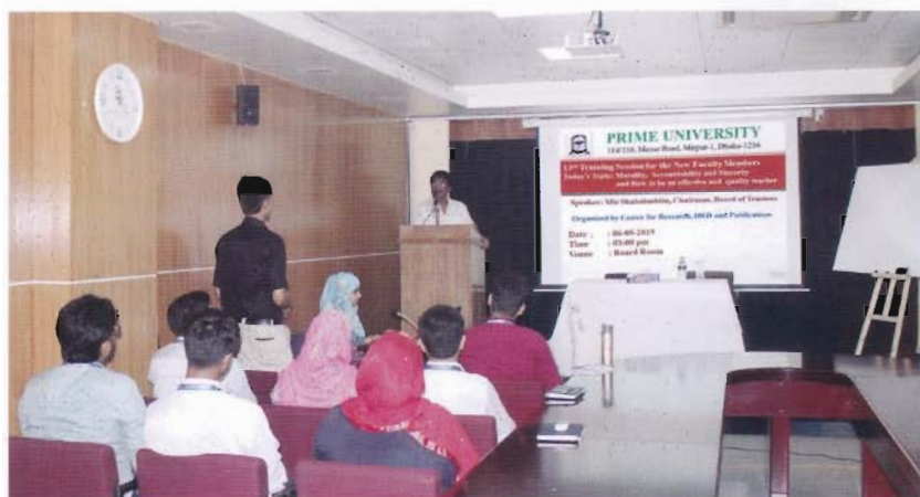
A view of the training program