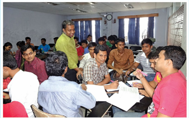
A group discussion in the class