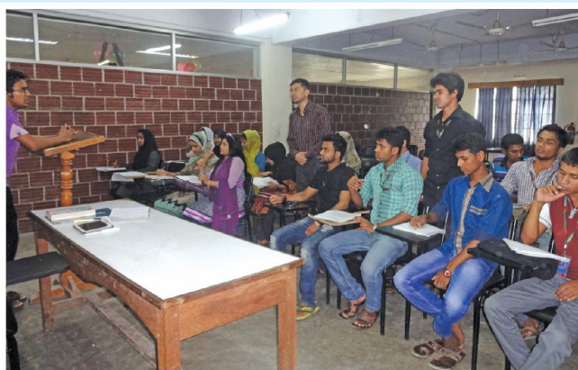
A question-answer session in Prime University Language School