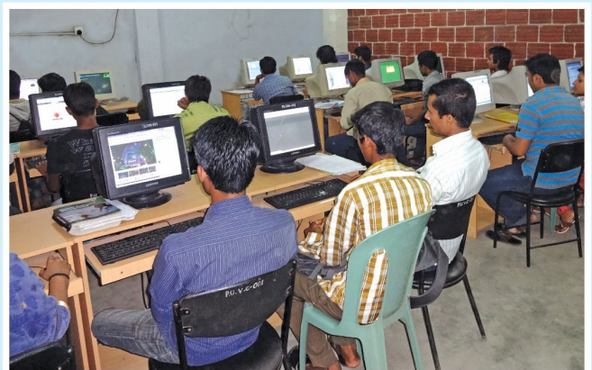
Students browsing in the computer lab