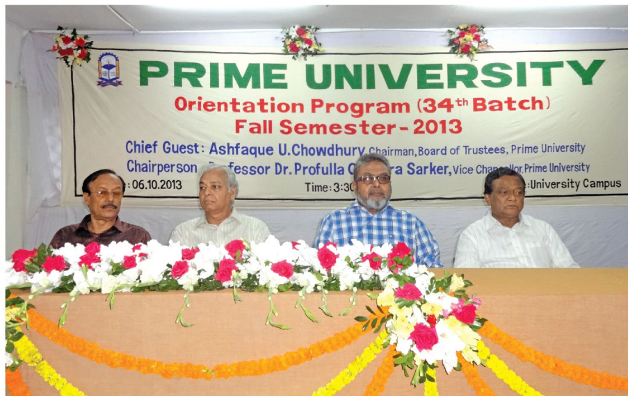
Board of Trustees Chairman, Member, Vice Chancellor and Dean are seen at the dais in the orientation program

The orientation program of the newly admitted students for Fall Semester 2013 in the different graduate and undergraduate programs of Prime University was held at the University Campus, Mirpur- 01 on October 06, 2013.