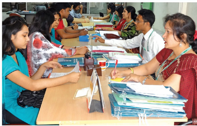
Counseling of the admission seekers at the Admission Office