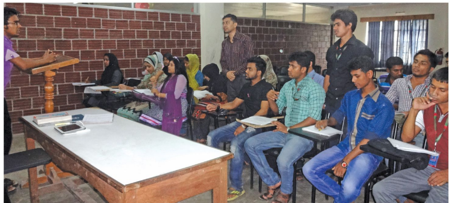
An English Language class in progress

Prime University Language School has been running under the supervision of the Department of English to improve the quality of English skills of the students, especially the newly enrolled students of the university. The Language School has successfully completed the English Language Course for the students of 17 th batch and welcomed the students of 18 th batch as well. The journey of the school started in 2007 and till today it has been contributing a lot for the development of English skills of the students of different departments. The four month course of the school