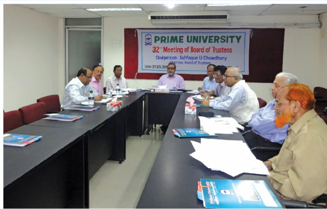
A view of the 32nd meeting of the Board of Trustees, Prime University Trust